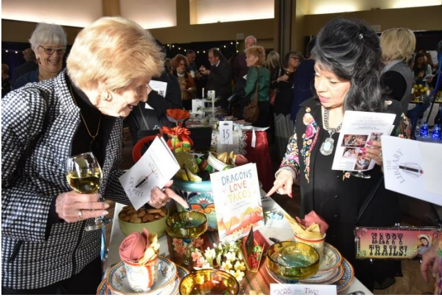
Attendees enjoy viewing and bidding on their favorite decorated tables at The Library Affair.

Approximately 85% of the work completed by the staff and volunteers of the Ruby M. Sisson Memorial Library Foundation was directed towards the Mountains of Opportunity capital campaign to expand and renovate the Ruby Sisson Library.